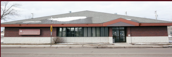
MARSHFIELD CLINIC DENTAL CENTER 315 MINER AVE. W.

Remember the good old days when a trip to the dentist or the eye doctor meant going downtown right next to the banks, cafes, stores & barber shops? Back when you could park the car in one spot and get all your errands done by walking the span of just a few city blocks? The doc knew you on a first name basis and you didn't need arrows and signs to navigate from the waiting room to the exam room? No, you aren't back in the good old days, but you can find convenient & professional healthcare services right in downtown Ladysmith sprinkled in among the banks, cafes, stores & barber shops. You can also find the same personal & friendly small town service that you came to expect back then too.