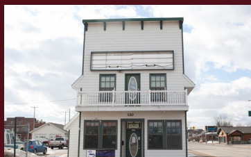
BO-JAMES GOODIES CAFÉ 120 1ST ST. N.