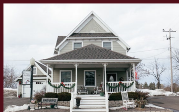
VILLAGE PARLOR 121 LAKE AVE. E.