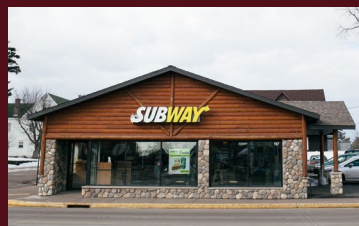
SUBWAY 117 LAKE AVE. W.