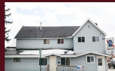
AMERICAN BAR 200 WORDEN AVE. E.