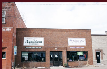
THE LUNCHBOX 117 MINER AVE W.

The cafes and neighborhood taverns characteristic of rural life in North-west Wisconsin still exist and thrive in downtown Ladysmith. If you want a Friday night fish fry, a juicy burger, a healthy salad, or a fresh deli sandwich with soup, you have your choice of establishments. The proximity to small, family-owned farms and the downtown farmer's market allows some of our restaurants to utilize locally grown ingredients, resulting in unique local twists on traditional dishes and farm fresh flavor. Ethnic food is also on the menu, featuring Mexican and Chinese cuisine.