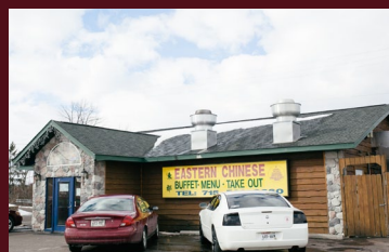
EASTERN CHINESE 125 LAKE AVE E.